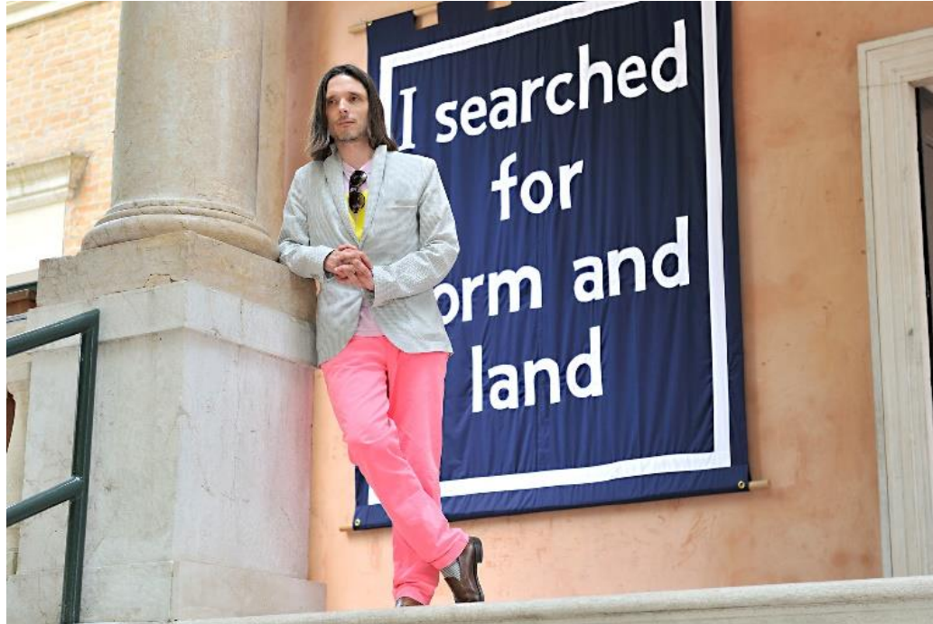
Jeremy Deller at the British Pavilion, Venice Biennale, 2013