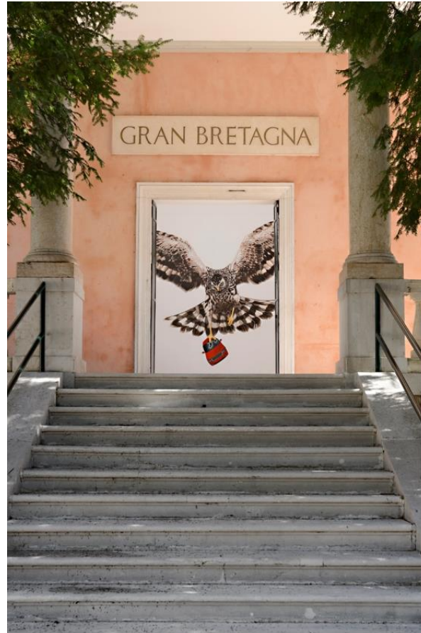
Jeremy Deller, English Magic , Installation view, British Pavilion, Venice Biennale, 2013.