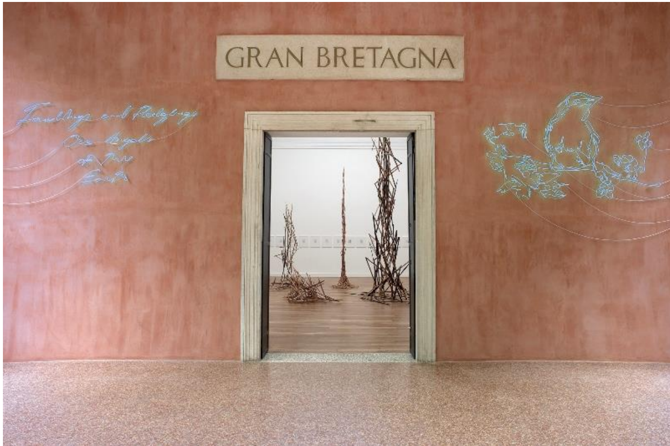
Tracey Emin, Borrowed Light , Installation view, British Pavilion, Venice Biennale, 2007.