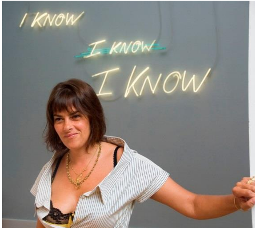
Tracey Emin at the British Pavilion, Venice Biennale, 2007.