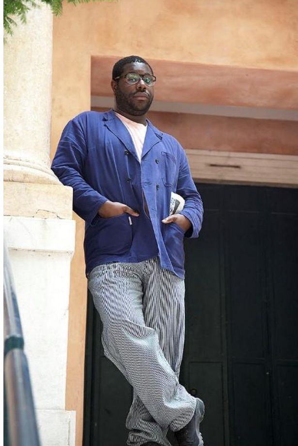
Steve McQueen at the British Pavilion, Venice Biennale, 2009